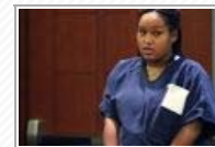
Godmother pleads not guilty to killing baby with metal pipe