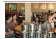
CHANG'S HONG-KONG CUISINE – BEST CURRENT DIMSUM RESTO IN LAS VEGAS