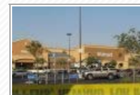
Walmart shooting leaves gunman dead, officer injured