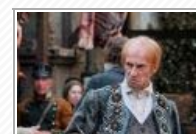
Russian film 'Faust' takes top prize in Venice