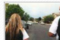
Principal hits streets in quest to bring students back to class