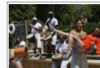
120+ stores and stars make Las Vegas shine for Fashion's Night Out